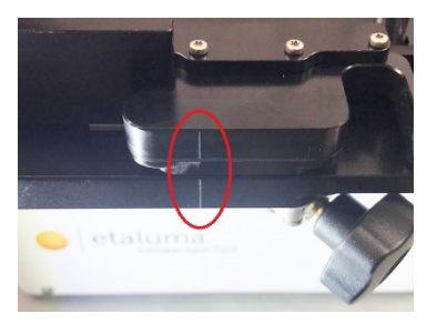
Fig 7. Alignment marks on LS720 plate carrier and top deck on instruments with subdeck Version

8. If the LS720 is being shipped to another end user, attach the sticker or a piece of removable tape over the power supply with a warning note to first remove shipping lock.