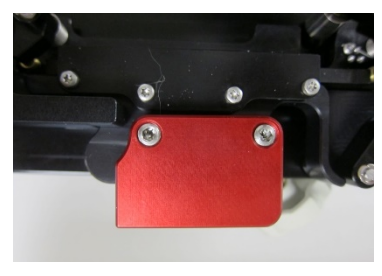
Fig 2. Installed shipping lock from top showing 2 set screws