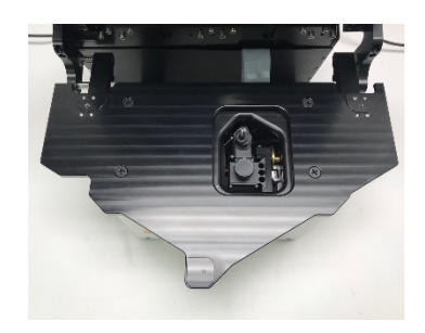
Fig 6. LS720 subdeck Version 2