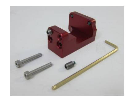
Fig 4. Shipping lock with screws & wrench